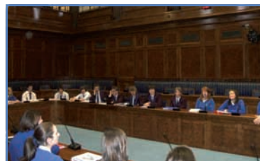
Good Morning Ulster Radio Broadcast