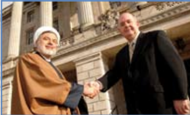
Iraqi Commissioner meets the Speaker

The External Liaison Unit provided an outreach service to representatives from statutory agencies, the voluntary and community sector and business groups, to explain how the Assembly works and to encourage their involvement. Organisations included the Northern Ireland Tourist Board, the Children's Commissioner, the Consumer Council, NICVA, Rotary Clubs, development organisations and residents' associations.