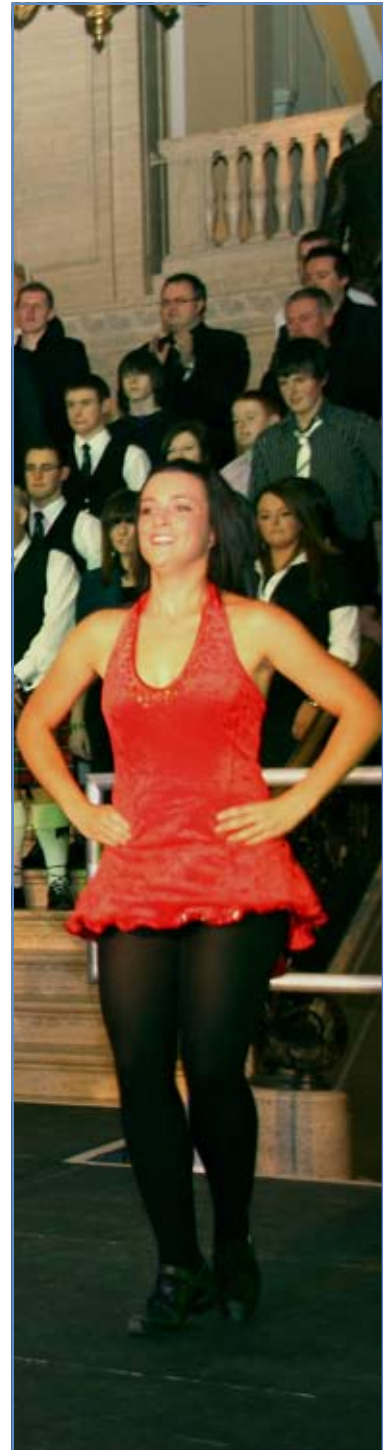
St. Patricks Day Event

The Education Service provides an Educational Visits Programme in Parliament Buildings. It also provides educational resources to support teaching and learning about the Northern Ireland Assembly, including an education website, http://education.niassembly.gov.uk . The Education Service seeks to encourage young people and others