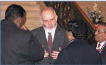
Sri-Lankan Delegation meets Deputy Speaker

Assembly Members attended the 10th European Parliament's Research Initiative conference on ICT for Parliamentarians hosted by the Houses of the Oireachtas in Dublin in March 2008. Parliamentarians got to share experience on how to secure greater voter participation at elections and increase public interest in politics using ICT.